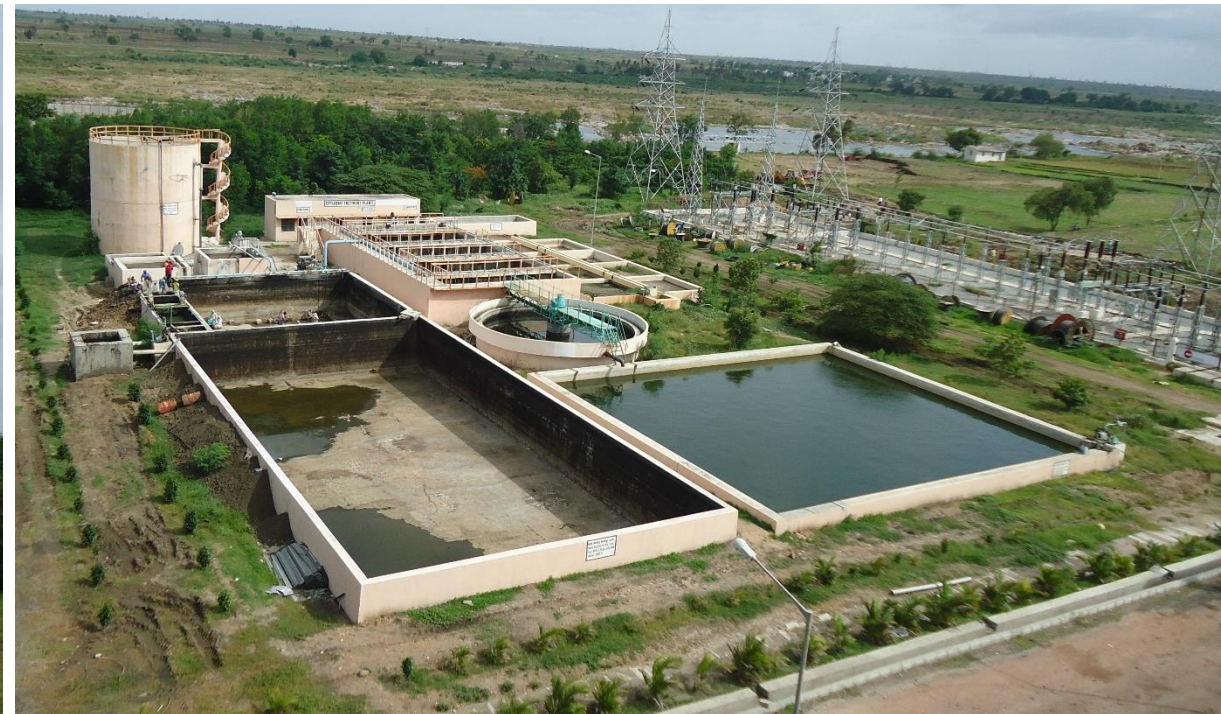
Picture 7: Wastewater treatment plant anaerobic system followed by aerobic system