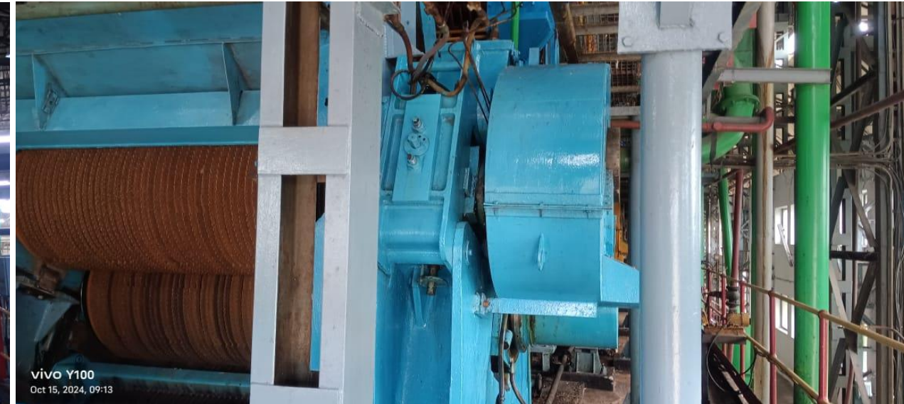
Picture 3: (a) Mill house where the cane is crushed to extract juice and (b) Evaporator section: responsible for converting diluted sugar juice into raw sugar and molasses