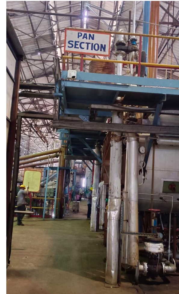
Picture 2: (a) Centrifugal section used for separation of sugar crystals from the molasses (b) Pan boiling section: sugar is extracted from mother liquor through crystallization