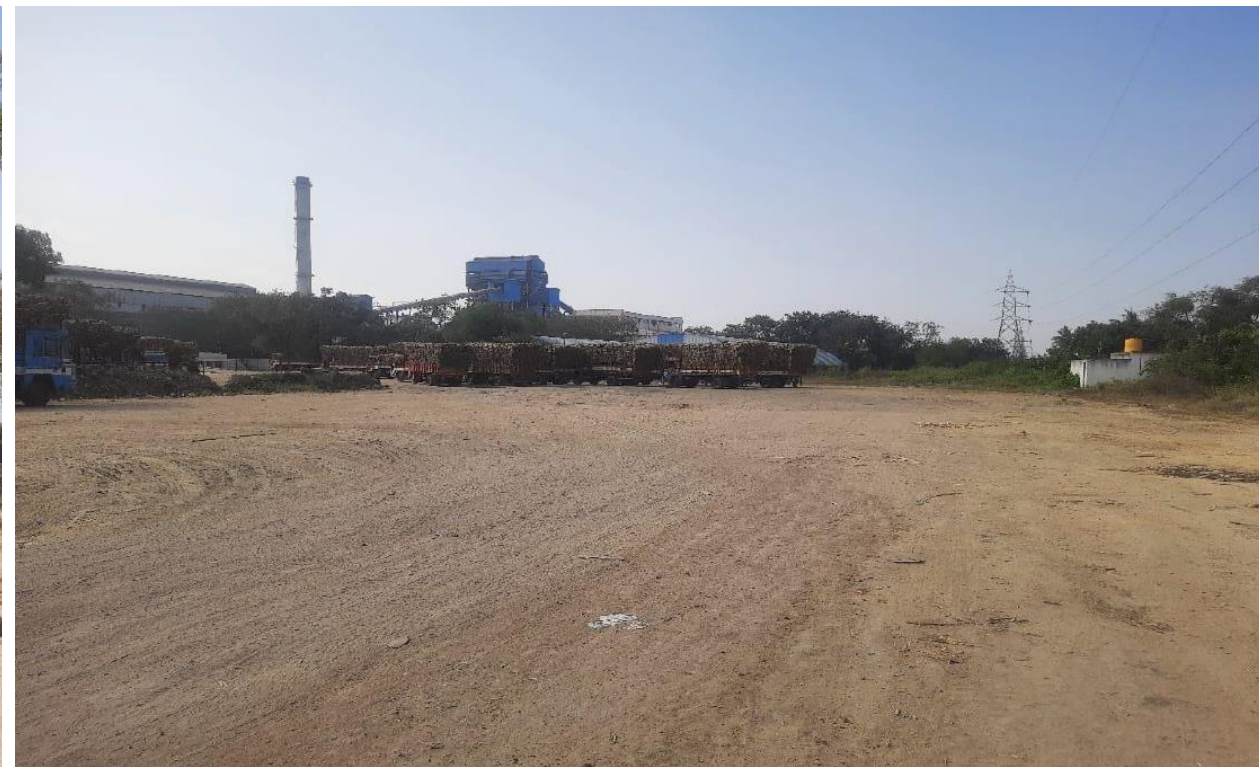
Picture 1: (a) Parking area for cane transporting vehicles and (b) Cane collection area