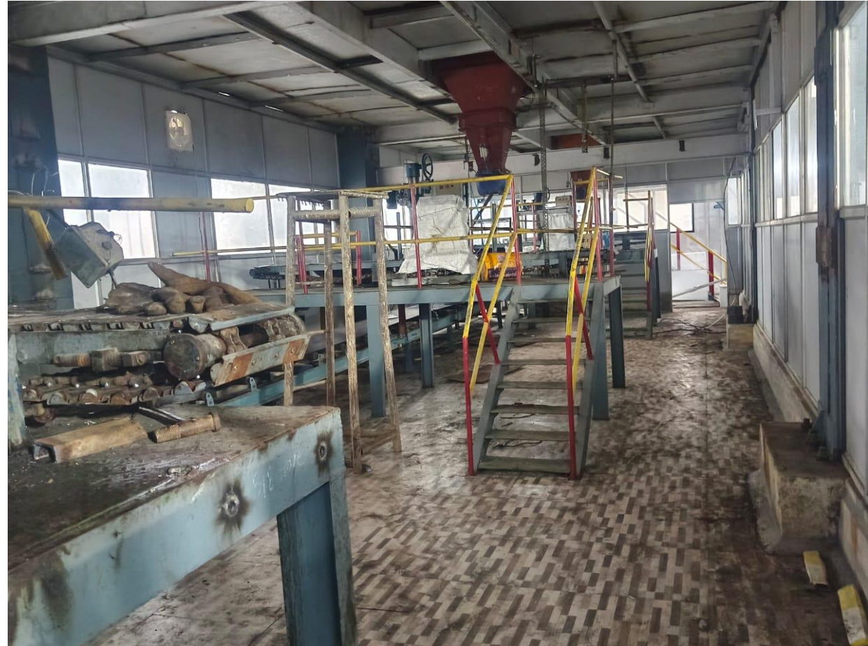
Picture 4: (a) Sugarhouse bin used to categorize sugar grains by size and (b) Sugar packaging area